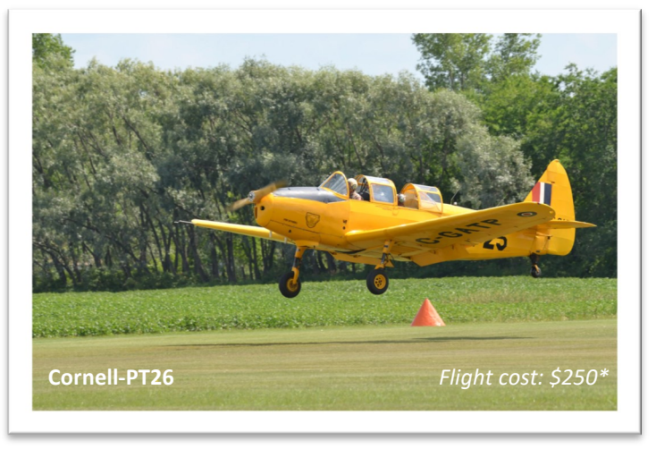
*plus $30 CATP Museum membership